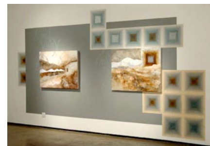
top: Nearer to Thee , installation view, 2008.