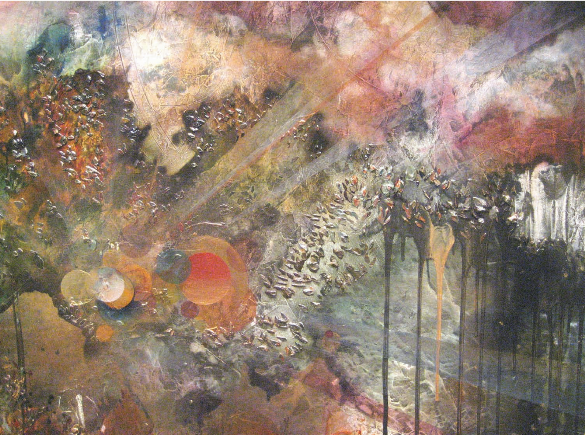
Nearer to Thee (detail), acrylic on canvas and wall, 2008.

She also takes into account the architecture of a specific location, allowing her wall paintings to adjust to the scale and conditions of a space. Because Wilder's paintings are most often realized on site, they are impermanent and in keeping with her view of experience as ephemeral.